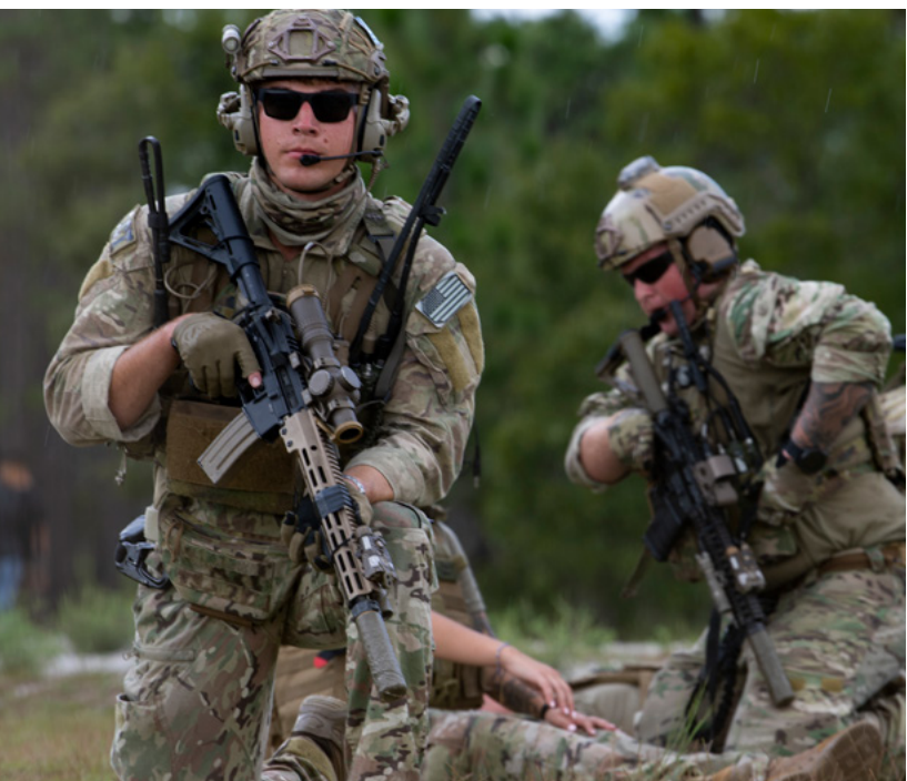
CCT First There - OL1998

Paired with experience from a 24 year career in Combat Control, the rigorous and immersive program at Tuck's school of business has accelerated development of my business acumen. Today I am better positioned to transfer my proven results oriented skill-set from the battlefield to the business community and support my family due to the support of the Combat Control Foundation and it's donors."