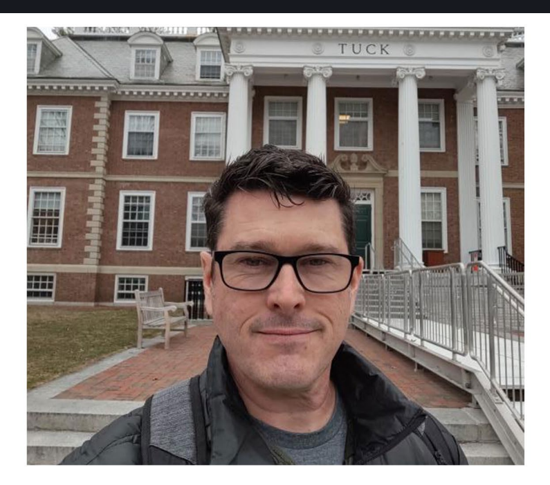
(above) CCT able to attend Tuck School of Business at Dartmouth. (below) Previous recipients of scholarships.

The support we offer supplements the funding available through available Air Force government programs, providing additional financial resources that would not otherwise be accessible. The Combat Control Foundation holds steadfast to its commitment to be First There in prioritizing the education of our warriors, families, and veterans. We strive to ensure they have the necessary means to pursue their educational goals and unlock their full potential.