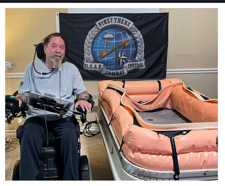
Combat Control Foundation provided an Air Fluidized Therapy Bed and a payment-free vehicle to a CCT who was severely injured during combat training.

In addition, our FT4-W program extends our support to family members who may be facing difficulties or limitations. Furthermore, a significant number of veterans grapple with the enduring consequences of sustained combat. The Combat Control Foundation remains steadfast in our commitment to be First There in promoting the well-being of our warriors, families, and veterans. We strive to ensure their continued health and provide the necessary assistance and resources to support their overall wellness.